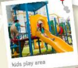
kids play area